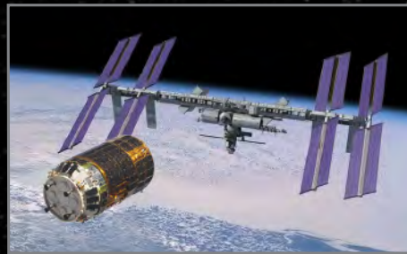
Full utilization and servicing of ISS in concert with International partners and commercial providers prepare for exploration beyond Low Earth Orbit