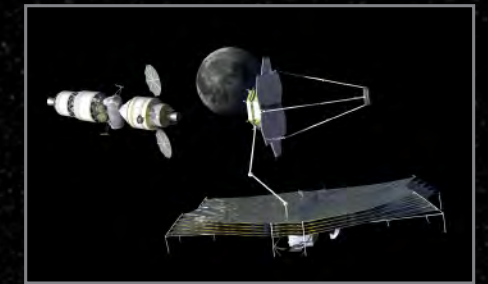
Construction and servicing of advanced telescopes and other In-space assets