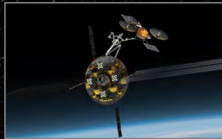
Hybrid reusable transportation infrastructure support for EM/L1/2, crew and cargo for Lunar exploration, and Satellite deployment & servicing