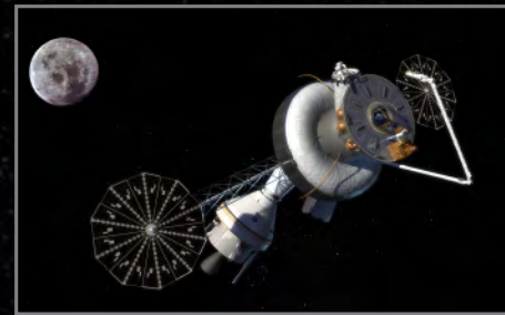
L1/L2 Gateway transportation node location for propellant depot and access to and from the Lunar surface