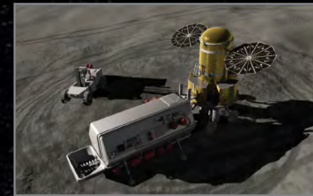
Lunar In-situ Resources Utilization produces water for rocket propellants and for sustaining surface operations with air and water